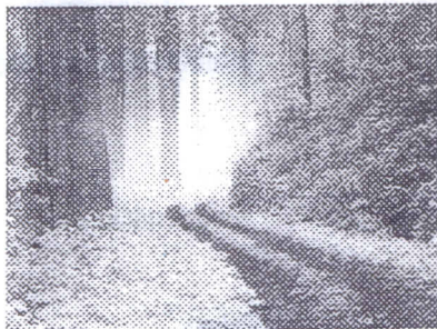
Path finder in research methodology